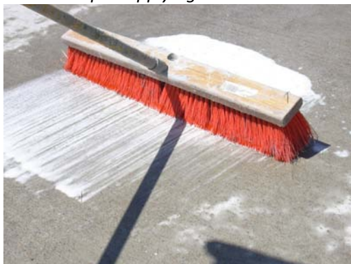
Example: Applying Etch N' Clean

of the concrete with a stiff bristle broom. The acid should only have contact with the concrete for a maximum of 10 minutes. Triple rinse thoroughly with water ( power washing is ideal ) and allow to dry a minimum of 8-10 hours . Remove loose aggregate by sweeping.