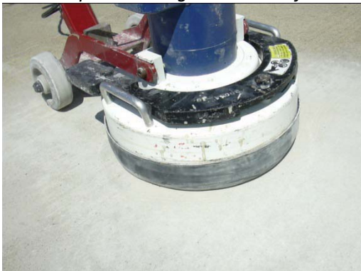
Example: Grinding concrete surface

of the concrete with a stiff bristle broom. The acid should only have contact with the concrete for a maximum of 10 minutes. Triple rinse thoroughly with water ( power washing is ideal ) and allow to dry a minimum of 8-10 hours . Remove loose aggregate by sweeping.